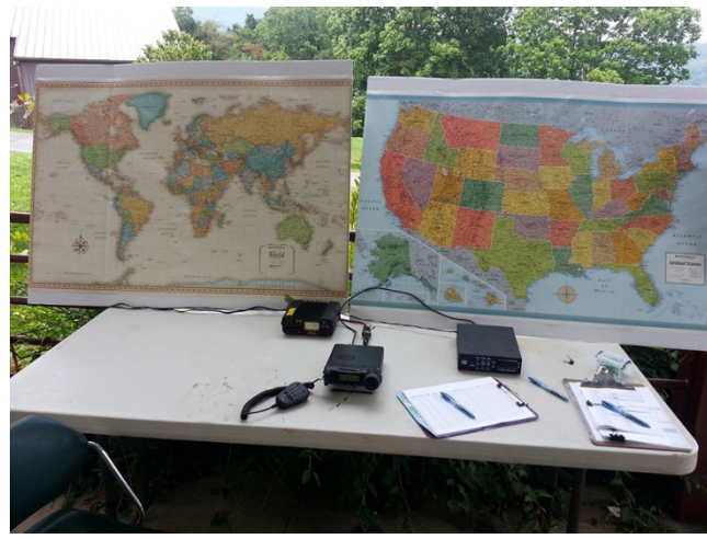
Portable station with maps for the kids

Back in August of 2014, we were talking to a woman at a florist who, if I'm not mistaken, was a cancer patient and she started speaking about the event in Virginia that was being set up for lots of kids that have cancer. I got the contact information and made contact with the coordinator for the Camp Fantastic Cancer Event in Front Royal, VA, and decided to get a special event call sign (N3C) and have a field day with the kids. On August 19, 2014, I went down and set up a remote station using a Yaesu 857D radio with an auto-tuner and a power supply. The antenna was a simple G5RV that we strung from the top of a flagpole to a building.