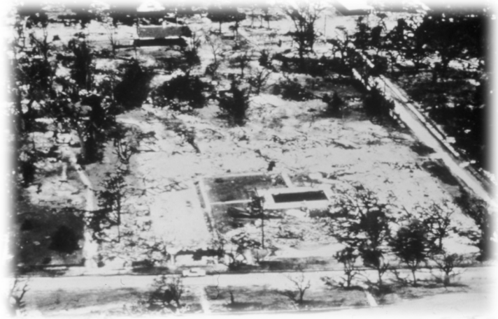
The Richelieu Manor Apartments in Pass Christian, MS before and after Hurricane Camille paid a visit.

Hurricane Camille killed 259 people and caused $1.42 billion (1969 USD, $9.27 billion 2017 USD) in damages. According to NOAA, "to date, a complete understanding of the reasons for the system's power, extremely rapid intensification over open water and strength at landfall has not been achieved".