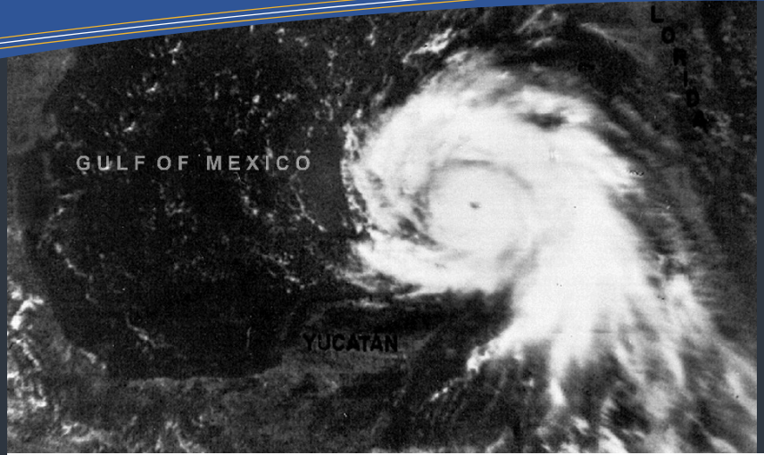
Hurricane Camille 1969

March 2025, we begin hosting a new video podcast to hosted on our YouTube Channel, www.youtube.com/HurricaneWatchNet. This program will focus on the tropics, the history of amateur radio's involvement with the National Weather Service and the National Hurricane Center, Hurricane Preparedness, and more.