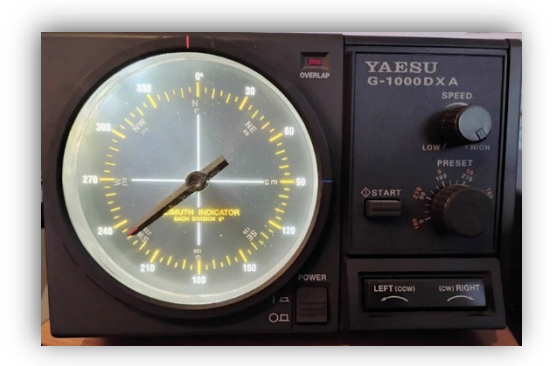
I made LED conversations to these meters in 2015 and they still look great.

The YAESU involves a lot of disassembly to get to the back of the display but when complete the result is a perfect edge light meter face. Once the meter was removed from the housing, I made up a 2-inch-long strip with short leads of about 4 inches each. I secured the strip once again using RTV silicone placing the SMDs against the clear plastic bezel. The old indicator lamp has 2 gray wires connected to it which go to the J 1006 connection point on the circuit board. Terminal # 9 (last wire on the left) is the 12v DC + connection leaving the other gray wire for the – connection. Since the factory lamp is on the opposite side, I soldered my leads to the gray wires and covered them with heat shrink.