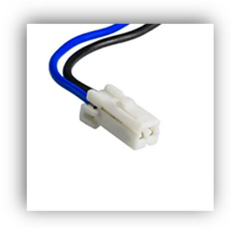
The above is with single or double-pin base